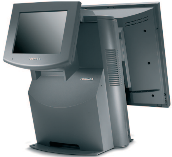
Shown: Independent customer display (6.5 VGA LCD) delivers customer information and digital, multi-media merchandising (optional)