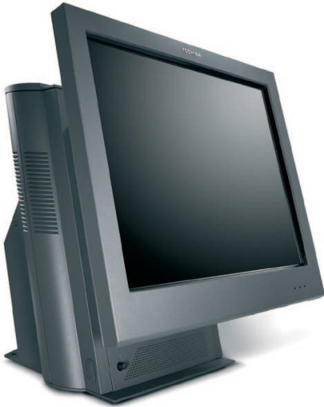
Shown: Toshiba SurePOS 500 Model 570